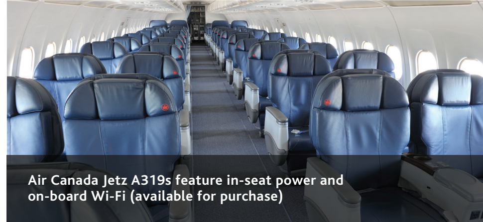
Air Canada Jetz A319s feature in-seat power and on-board Wi-Fi (available for purchase)