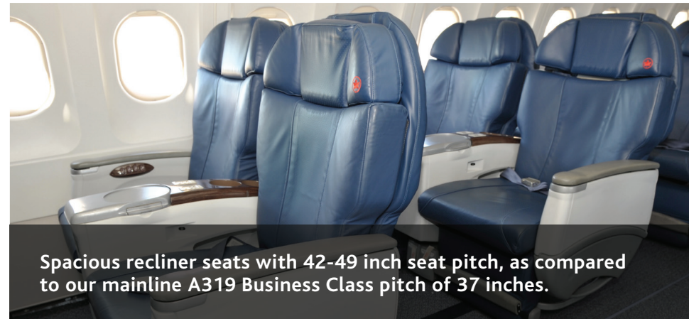
Spacious recliner seats with 42-49 inch seat pitch, as compared to our mainline A319 Business Class pitch of 37 inches.